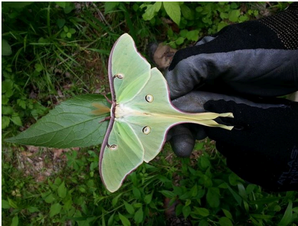
Luna moth in Baker Preserve

Some of the trail names may arouse curiosity. Liar's Ridge Trail refers to the tall tales told by some members of the trail crew while building it. The Mythical Tree Trail refers to a large fallen trunk that was blocking that trail when its route was initially planned, the size of which grew to mythical proportions in the minds of those who were going to have to cut it eventually. When finally cut, it turned out to be less impressive than imagined during the months of procrastination. Four pieces cut from the trunk remain along the trail as seats for hikers. Cockatiel Ridge refers to an incident in 2008 when an Ohio University student doing a project for a botany course saw a Cockatiel in the trees, lured it down, and caught it. Not wanting to keep it herself, she took it to a pet shop a few miles away, which it turned out was the place the bird had escaped from days earlier. The famished Australian bird, unable to feed itself in the wilds of Ohio, eagerly returned to its cage and gorged itself.